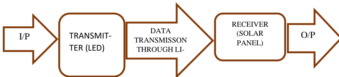
Figure 1.block diagram of data transmission through light

3. Design & Simulation: The block diagram of the design which is proposed is been delineated in Fig.1 the light-fidelity is used in wireless data transfer in the help of light emitting. This system provides high security data transfer. In that system here we describe about the how a small LED light-Ray reflect on the solar panel. Here solar panel acts as a receiver.